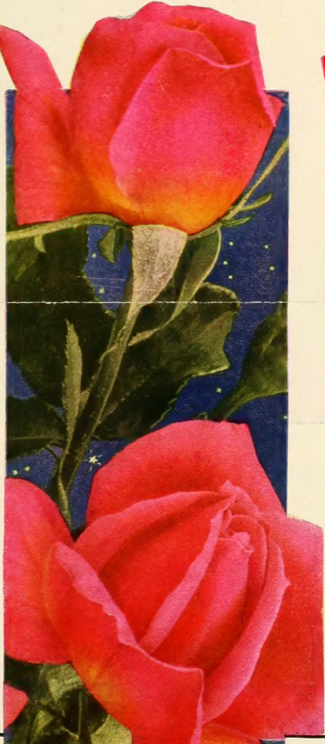
★Luis Brinas. $1.50 (in ★ Dozen) Plant Patent No. 102

H.T. (P. Dot, 1934.) Plant Patent No. 102. Orange-copper. There is not a jarring note in the entire color-range of this Rose, from bud to faded bloom. Fine pointed buds of orange-copper open slowly, the petals curling back, making a starry flower with a high center. It is fully double, with 75 to 100 petals, and when entirely open the color is soft old-rose, flushed with gold. It has a distinctive fragrance, recalling the scent of new-mown hay. The plant is continually putting out new canes from the base, which furnish a continuous crop of bloom. Gold Medal, Bagatelle, 1932; First Class Certificate (highest award), National Rose Society of England, 1932; Gold Medal, Saverne, France, 1933. $1.50 each; 6 for $7.50, delivered.